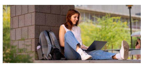
Creative, conscientious innovation

As artists, advocates and intellectuals, faculty and scholars in the Department of English explore global expressions of the English language in all media.