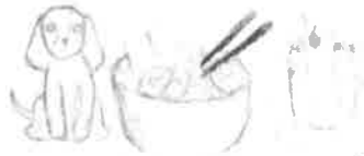
Silicon Valley, CALIFORNIA