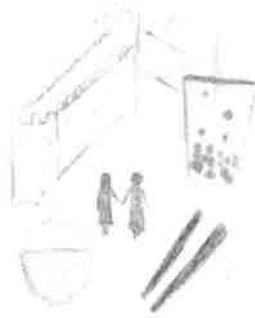
Jiangsu & Beijing, CHINA