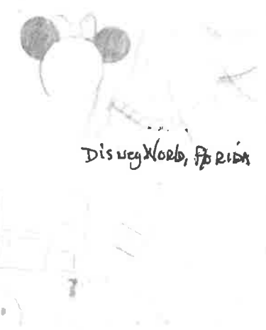
Disney World, FLORIDA